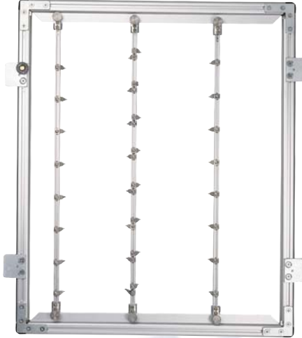
25 mm Solder Frame