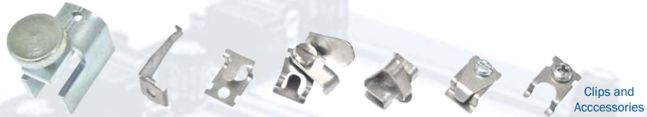
Clips and Accessories