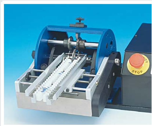
CS30 FEEDER for TP6/V (Cod.51.0300)

WIDTH = 22 cm DEPTH = 24 cm HEIGHT = 10 cm PACKING = 29x24x24 cm VOLUME = 0,020 m 3 FEEDER WEIGHT = 2 kg GROSS WEIGHT = 3 kg