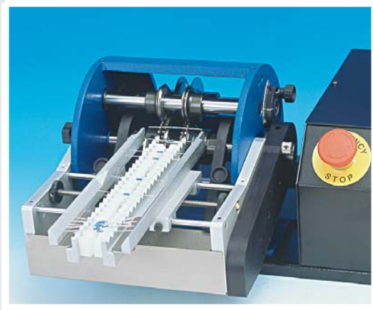
CS10 FEEDER for: TP6, TP6/PR-B, TP6/S (Cod. 51.0100)