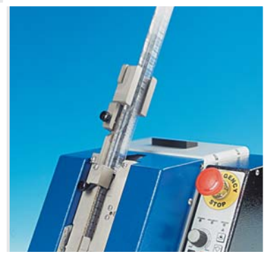
TP/TC4 with stick holder BR5 ( Cod 78.0005)