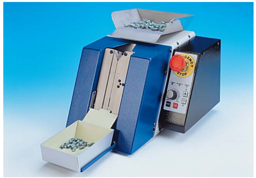
TP/TC4 220 V (Cod. 74.OL22)

LEAD DIA. = 0,4 - 0,8 mm (.015-.031") PRODUCTION = LOOSE 3.000 p/h TAPED 15.000 p/h