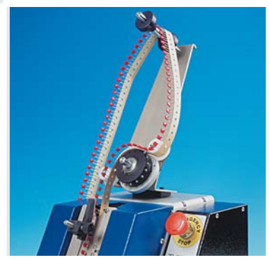
Reel Holder BR3 P. 12.7 mm ( Cod. 78.0001) P. 15 mm ( Cod. 78.0002)

cutting machine for loose radial components